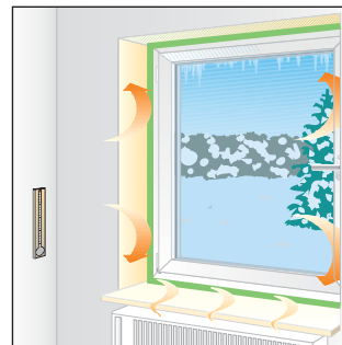
Fig 3 Optimal thermal insulation