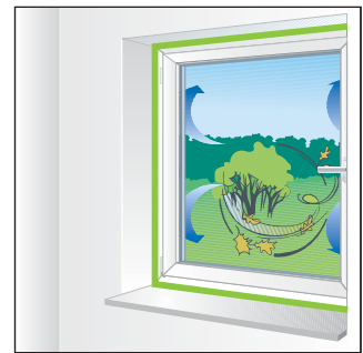
Fig 2 Seals against draughts