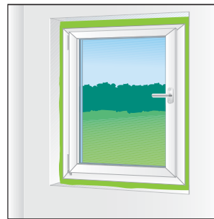
Fig 1 For the perimeter sealing of windows & doors

sales.uk@tremco-illbruck.com www.tremco-illbruck.co.uk